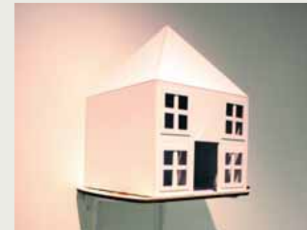
Volume 20 January – 13 February 2006