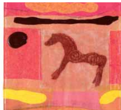
Ian Robertson 10 September – 16 October 2005