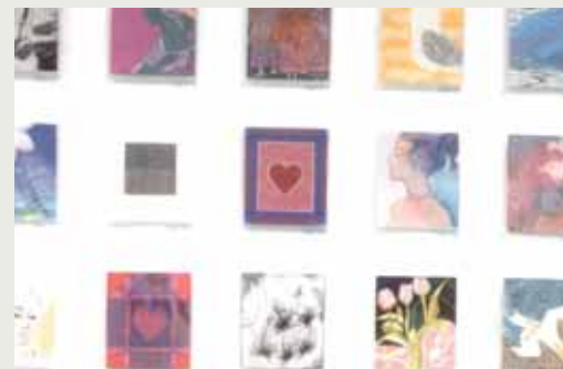
CD Exhibition 3 December 2004 – 15 January 2006