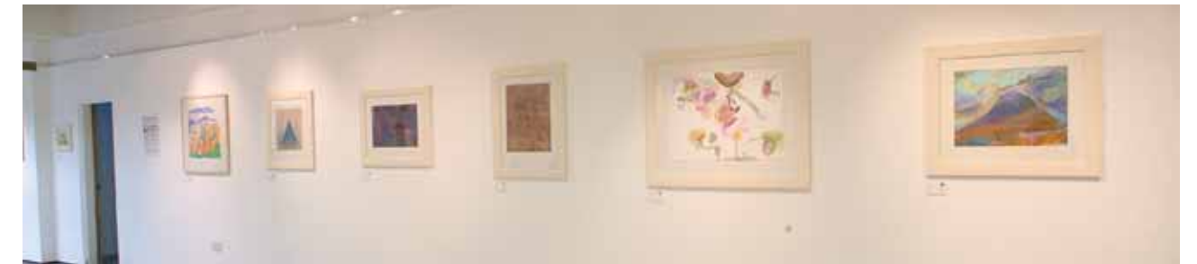
A Penny Wrapped in Silver - Art in Hospital Exhibition