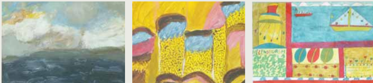
Images from Art in Hospital Exhibition – A Penny Wrapped in Silver

The seminar was planned to coincide with the opening of A Penny Wrapped in Silver, an exhibition of patients' artworks from Art in Hospital projects, at the Art Gallery in ARI.