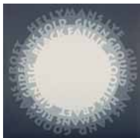
Arthur Watson Skateraw

'Although a group show, the artists included in wordwork all use words quite differently and to different effect. However, they are all actively engaged in seeking to communicate directly with their audience.'