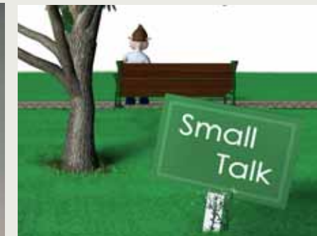
Lynn Love 20 January – 13 February 2006