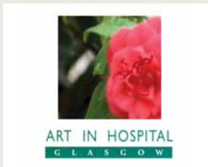
Art in Hospitals 25 February – 16 April 2006

Many positive comments have been left by visitors to the Art Gallery over the year, a selection of which are detailed below.