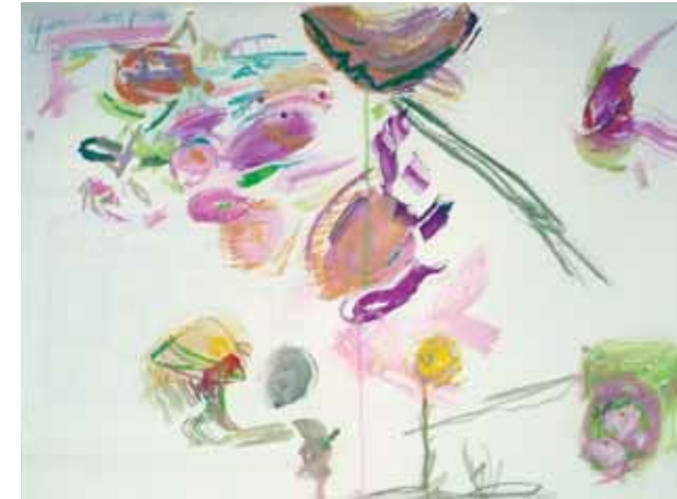
From Art in Hospital Exhibition

The writer's post is supported by the Friends of Roxburghe House.