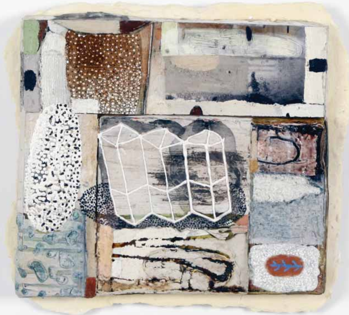
Lennox Dunbar Beach