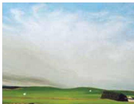
Sandy Grant / Sue McPherson 29 July – 4 September 2005