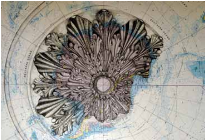
Above, Bridget Steed, Antarctic Circle (detail)

Front cover image: George McArthur, untitled