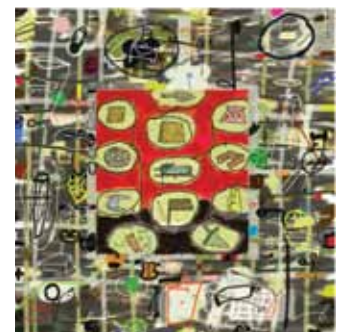
Lennox Dunbar, The Hungary Series (4 of 44)