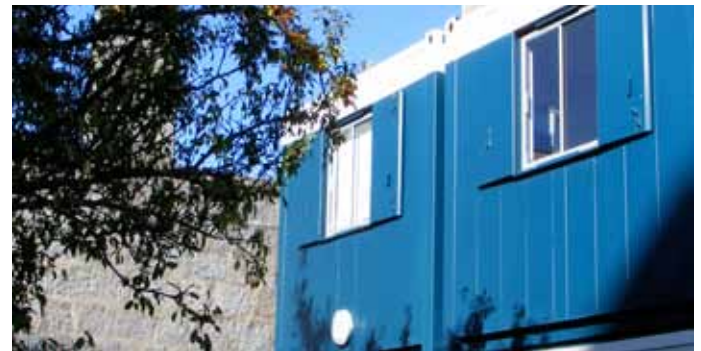
The new GHAT office