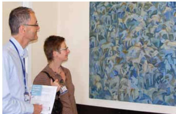
Sophie Ormerod's painting Horse Halt Gray's Graduates Exhibition 2010